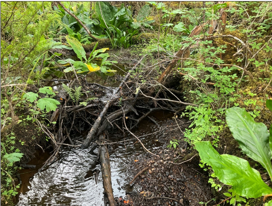
Figure 2.—Small woody debris jam at waypoint 1138.