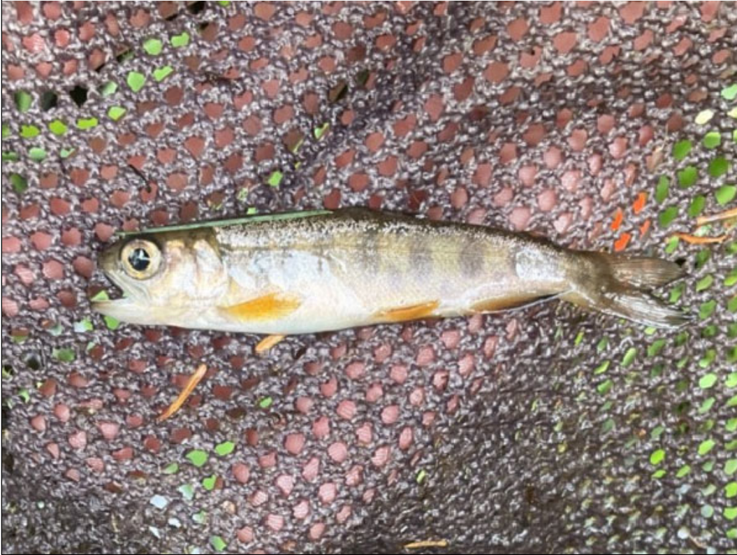
Figure 1.—Juvenile coho salmon captured at waypoint 1138.